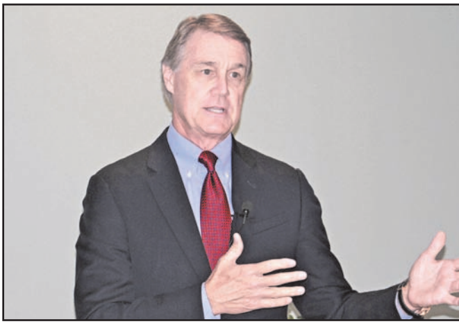
U.S. Sen. David Perdue in Union County on Thursday, Aug. 24.

said Perdue, was economic opportunity for all, which, though not guaranteed, is found in abundance throughout the