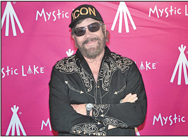
Hank Williams Jr

Anderson Music Hall holds 2,900 people and you can bet your bottom dollar, those attending have got a shotgun,